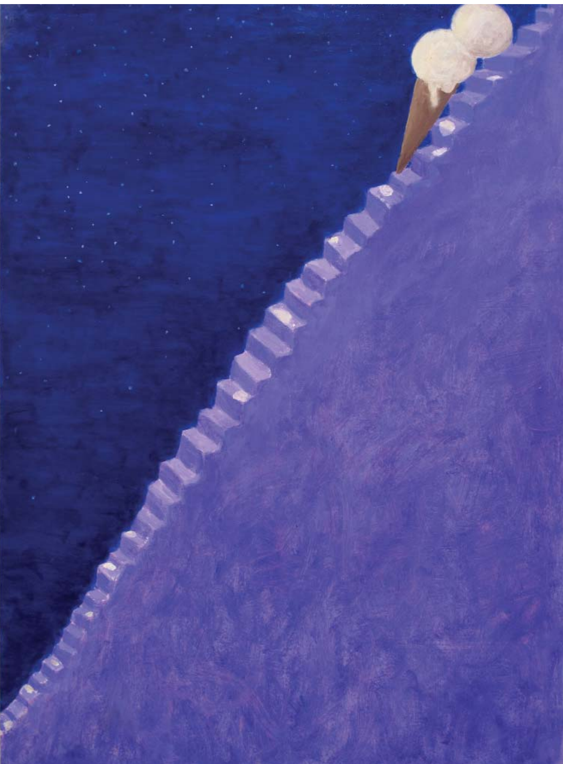
Scott Reeder, Sisyphus Ice Cream , 2010. Oil on linen, 38 × 28 in. (96.5 × 71.1 cm). Courtesy Luce Gallery, Turin, Italy.